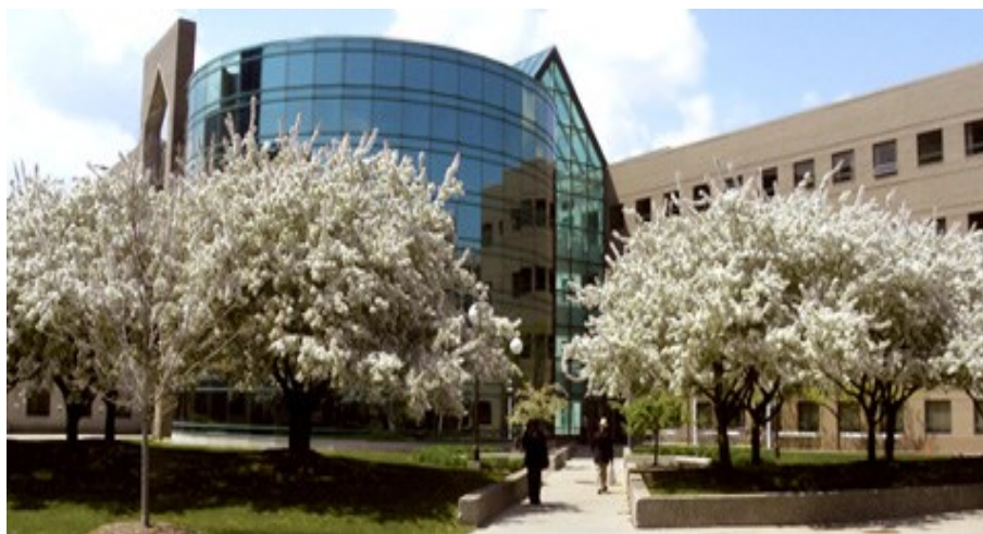
Faculty Administration Building